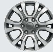
18" 6x2-Spoke Aluminum Standard

ICE Pack 104: includes AM/FM stereo with SYNC 3, Navigation, 8" touchscreen, high-series cluster, 2 USB ports and 6 speakers (RHD)