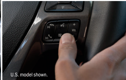
U.S. model shown.