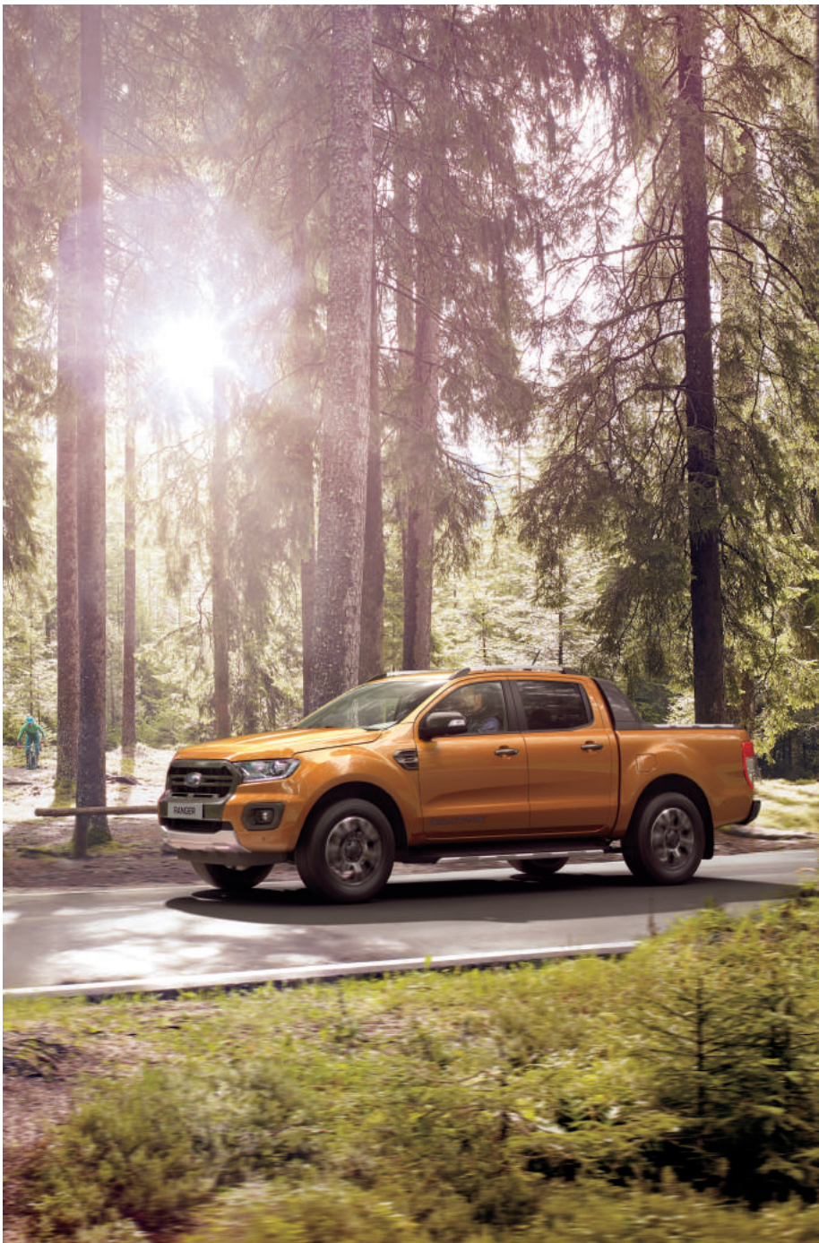
WILDTRAK Double Cab 4x4. Saber. Available equipment.