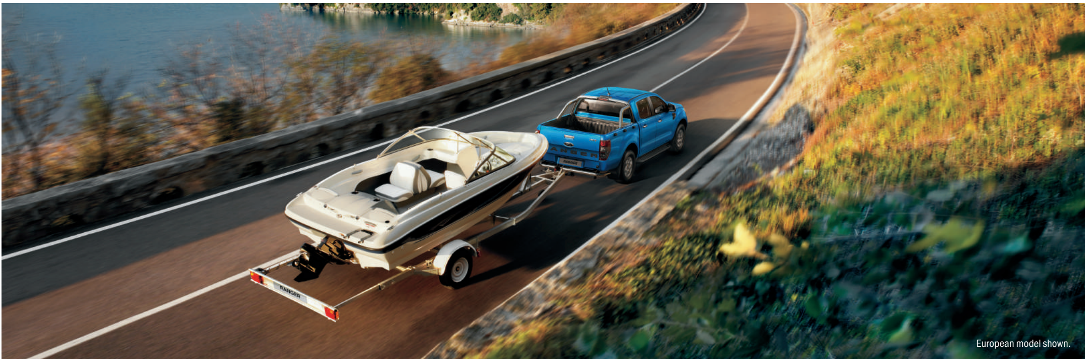
European model shown.