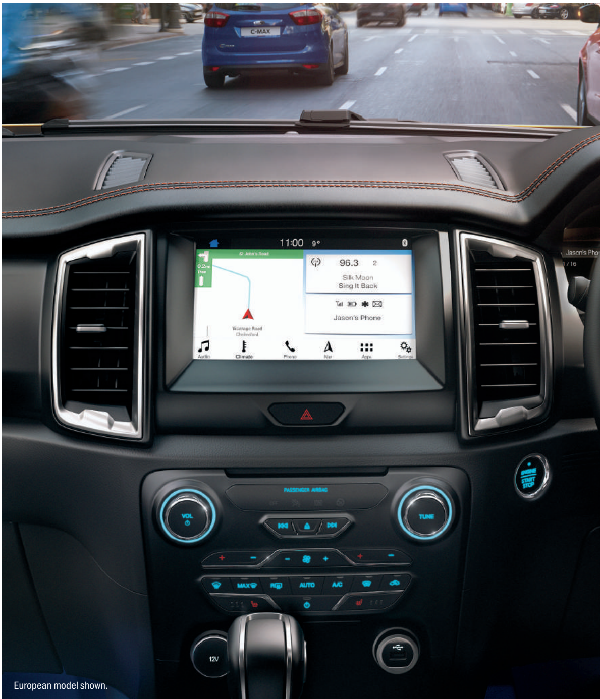
European model shown.